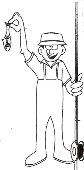
Fisherman Pole Fish