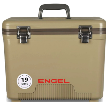
Engel Dry Box/Cooler