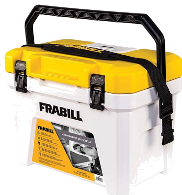
Frabill Bait Station